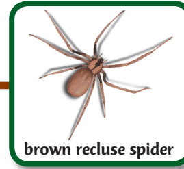
brown recluse spider