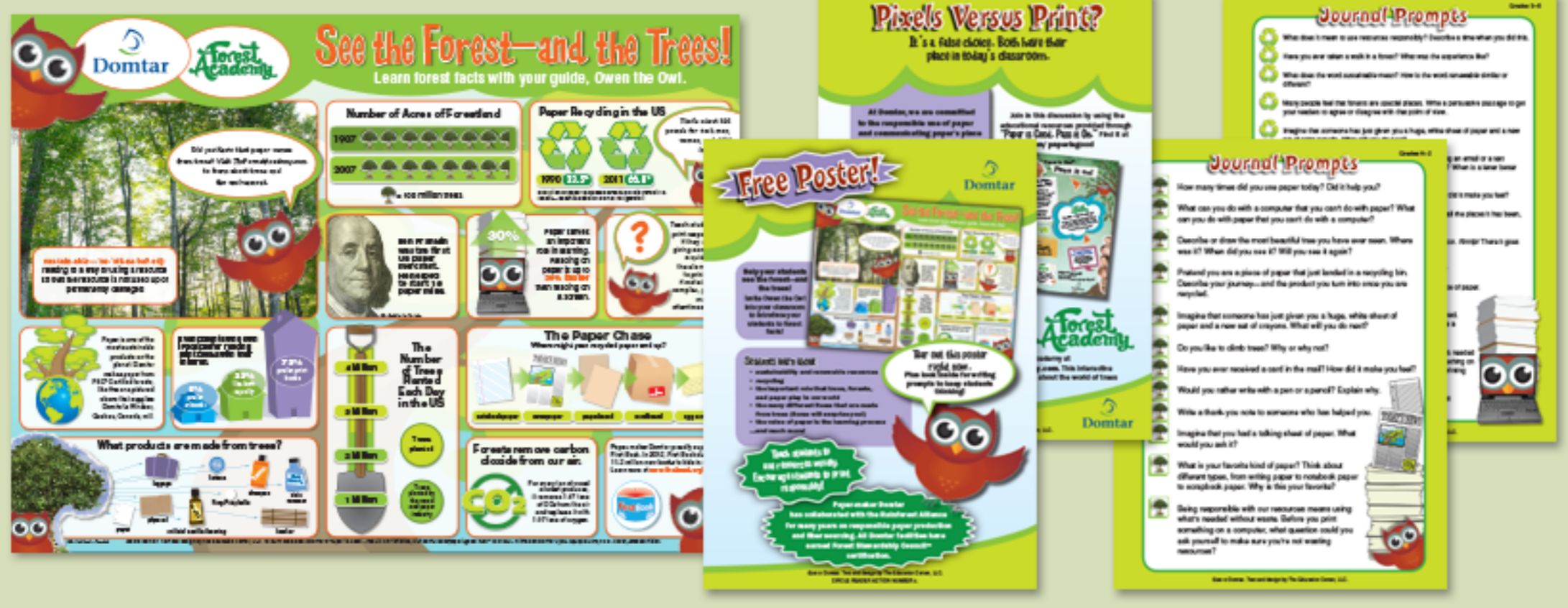
Information-packed infographic poster and writing prompts for grades K-2 and grades 3-5